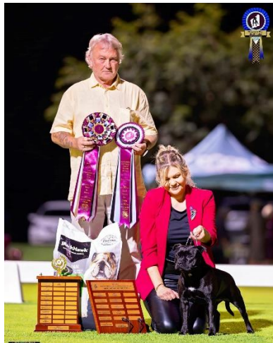
RUNNER UP TO BEST IN SHOW ONAHU HUNTRESS