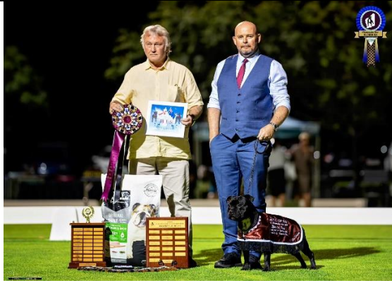
Dog Challenge STAFFEGAN BULLSEYE