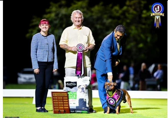
Reserve Dog Challenge FORMULABLUZ MASK IZ OFF(AI)