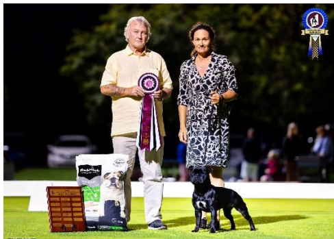
Intermediate In Show STAFFEGAN HEART OF GLASS