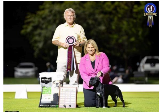
Best Junior In Show KABERE JUST BOUT JAK O YA(AI)