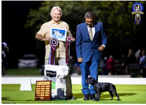
Best Baby in Show & Most Promising Puppy on the Day SEZANUFF SHEZALLASSNMOR