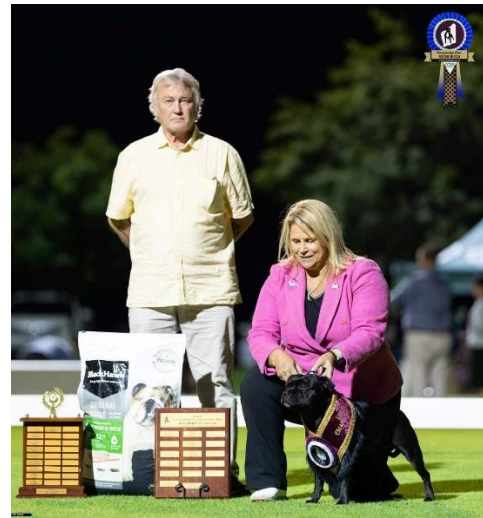
Reserve Bitch Challenge AUST SUP CH KABERE YAMADEMEGOFULLNINJA