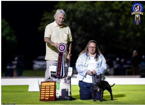
Best Puppy In Show WESTVIKING SUNSHINE LOLLIPOPS