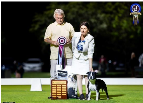
Veteran in Show CH. FARRUGSTAFF TEARDROP OVA CLOWN