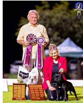
Open in Show ONAH I HUNTRESS