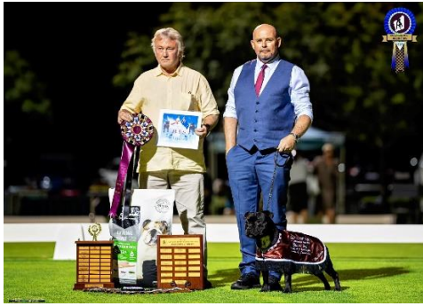
Australian Bred in Show STAFFEGAN BULLSEYE