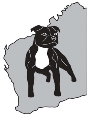
STAFFORDSHIRE BULL TERRIER CLUB OF WESTERN AUSTRALIA