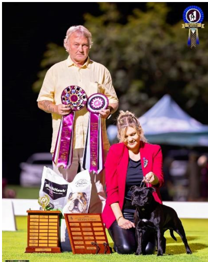
Bitch Challenge ONAHI HUNTRESS