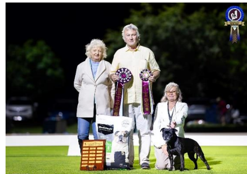
Neuter in Show NEUT GRAND CH. STAFFEGAN GEMS PRIDE