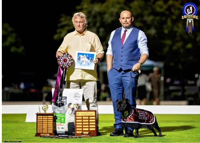
BEST IN SHOW STAFFEGAN BULLSEYE

Major Sponsor: BlackHawk