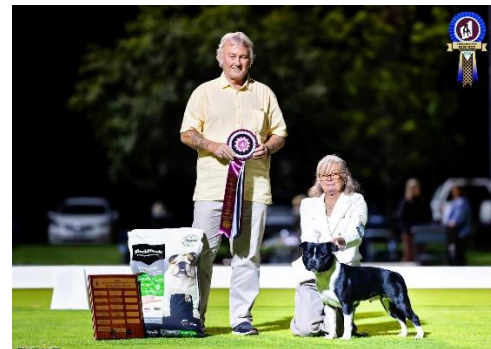
State Bred in Show STAFFEGAN FROST BITE