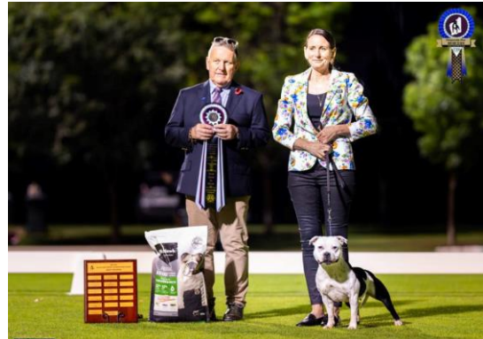
Open in Show & BCC KELTRICE MY FAIR LADY RN.