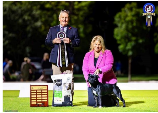
Best Junior In Show KABERE JUST BOUT JAK O YA