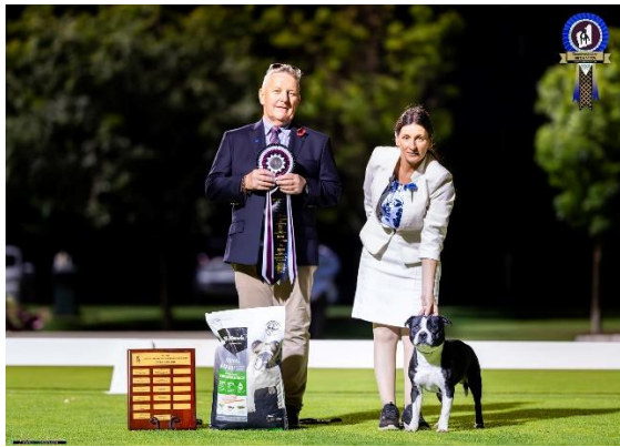
Veteran in Show CH. FARRUGSTAFF TEARDROP OVA CLOWN