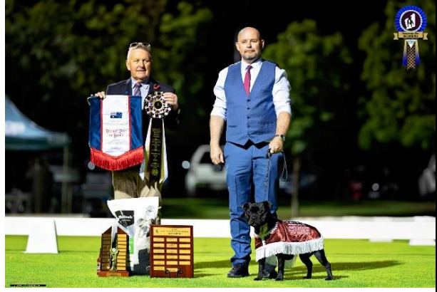
Reserve Dog Challenge STAFFEGAN BULLSEYE