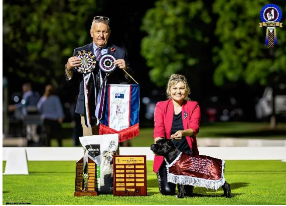
Dog Challenge CH. ONAHI ATTICUS (AI)