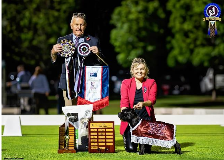
BEST IN SHOW CH. ONAHI ATTICUS (AI)

Major Sponsor: BlackHawk