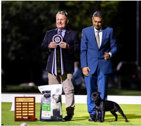
Best Baby in Show SEZANUFF SHEZALLASSNMOR