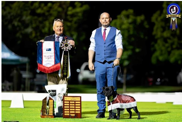
RUNNER UP TO BEST IN SHOW STAFFEGAN BULLSEYE