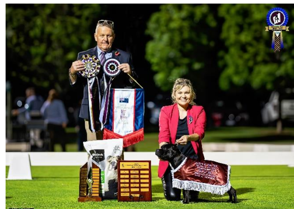
State Bred in Show, DCC & BIS CH. ONAHI ATTICUS (AI)