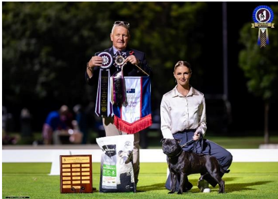
Best Puppy In Show & Most Promising Puppy on the Day WESTVIKING READY AIM FIRE