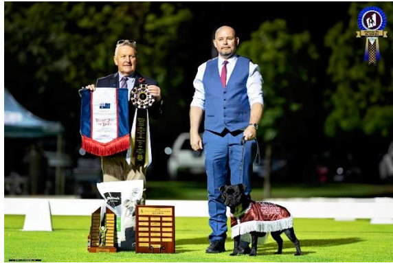
Australian Bred in Show, RDCC & RUBIS STAFFEGAN BULLSEYE