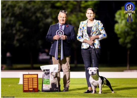
Bitch Challenge KELTRICE MY FAIR LADY RN.