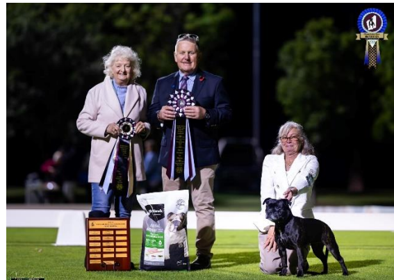
Neuter in Show NEUT GR CH. CH. STAFFEGAN GEMS PRIDE