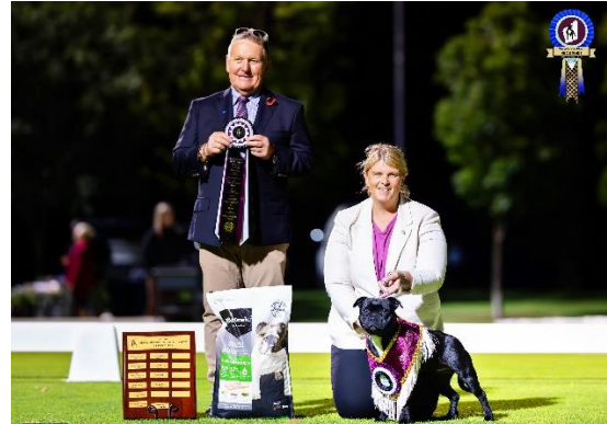
Reserve Bitch Challenge LILROCK NEVER DA DEVIL JC