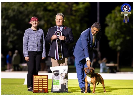
Intermediate In Show FORMULABLUZ MASK IZ OFF (AI)