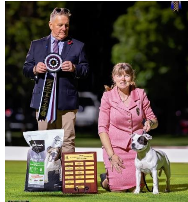
Best Minor in Show POWERPAWS JUS LIKE JESSE JAMES