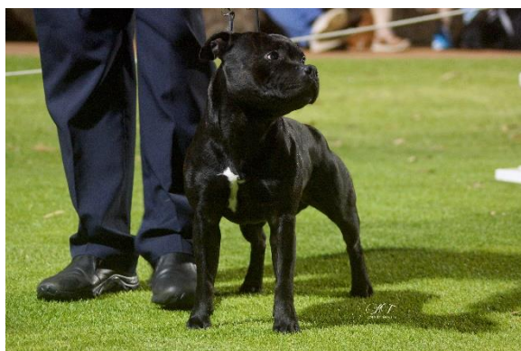
1 st BUSTABONES, Sup Ch Bustabones Wot Do Monsters Eat