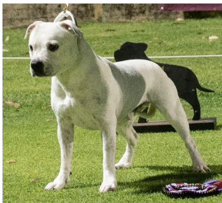
1 st KESIC, Ch Akinos The Snowman

2 nd , Farrugia, Ch Farrugstaf Red Temper