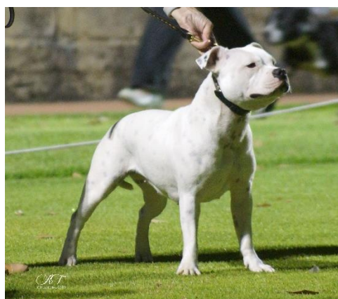
1 st COETZER/REID, Zeracious Sudden Impact