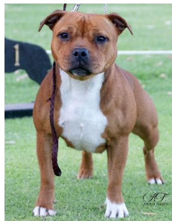
1 st SHADOWSTAFF, Ch Bxact Talking Point

2 nd , Park Findlater, Westrova Stoic At Artisinal (AI)