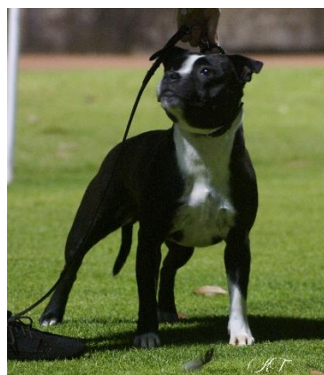
1 st COOK, Staffegan Spirit of Bailey

2 nd Morton/ Wymark, Ch Savion Razzel Dazzel 3 rd , Bawden, Ch Castlebar Ring Side Riot