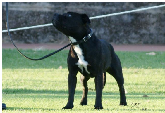
1 st PARK FINDLATER, Powerpaws Flower of Scotland

2 nd , Shadowstaff Knls, Shadowstaff The Mistress