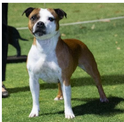
1 st SHAW, Ch Canakey Sweet Dreamer (AI) (Imp UK)

2 nd , Kavanagh, Ch Strongstorm Podium Dancer 3 rd , Cook, Staffegan Gems Pride