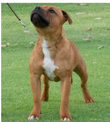
1 st SHADOWSTAFF, Redlabel The Kessel Run