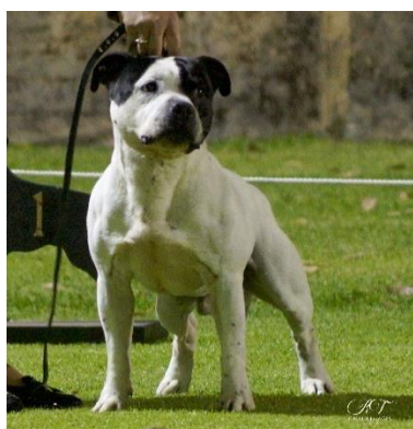
1 st E Park Findlater, Sup Ch Artisinal Why So Serious

2 nd , Bawden, Ch Castlebar the Confederate