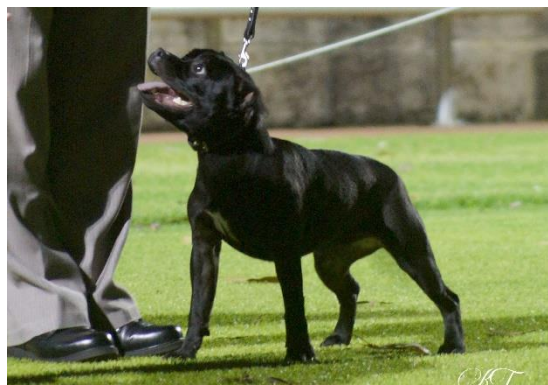
1 st KESIC, Akinos Aphrodite