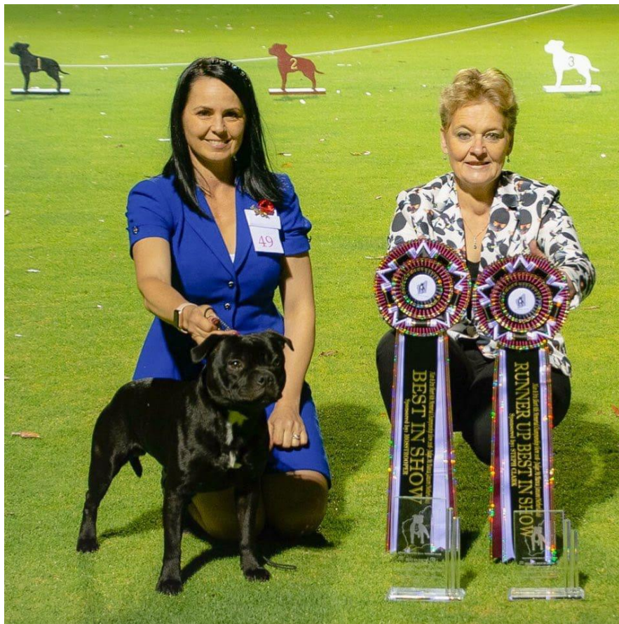
Best in Show Ch Solostar One Last Dance