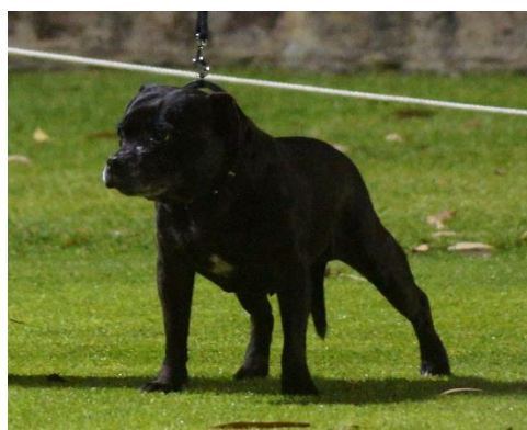
1 st STROVER, Grd Ch Crossguns Lady Madonna