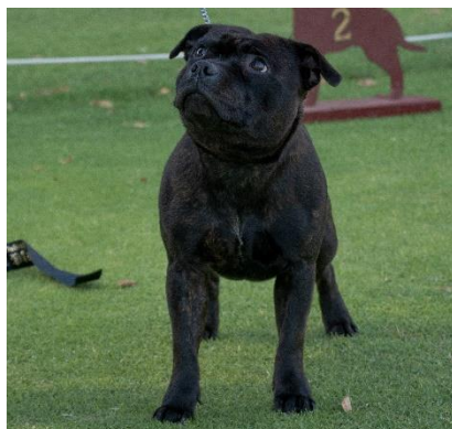
1 st KESIC, Akinos Tempress

2 nd , Bawden, Ch Castlebar Raise the Roof