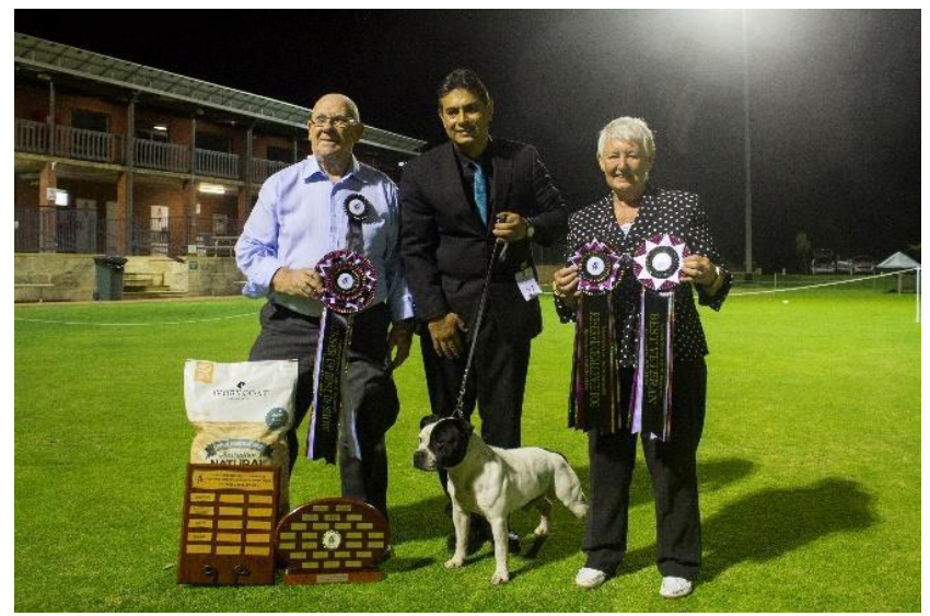
E Park Findlater, Sup Ch Artisinal Why So Serious RUBIS, RDCC & Veteran in Show