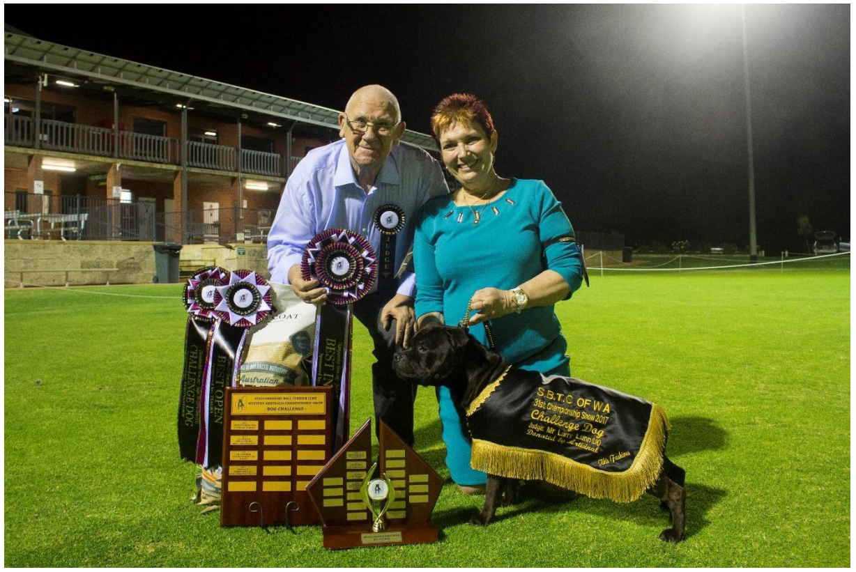
Best in Show