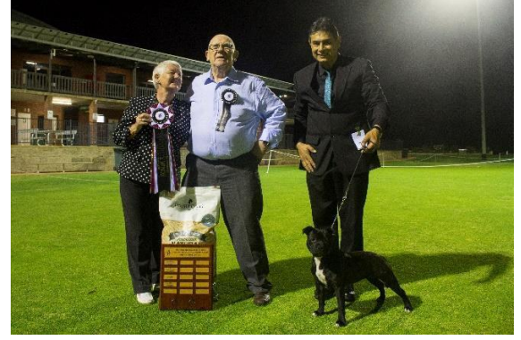
1<sup>st</sup> E Park Findlater, Westrova Stoic at Artisinal (AI)