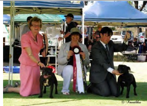
VETERAN IN SHOW Ch Highbourne Makybe Diva OPPOSITE VETERAN IN SHOW Ch Crossguns Jet Setter