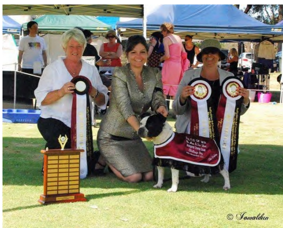
BEST IN SHOW Ch Artisinal Why So Serious E Findlater