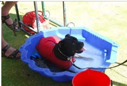
Baxter chilling out whilst exhibiting