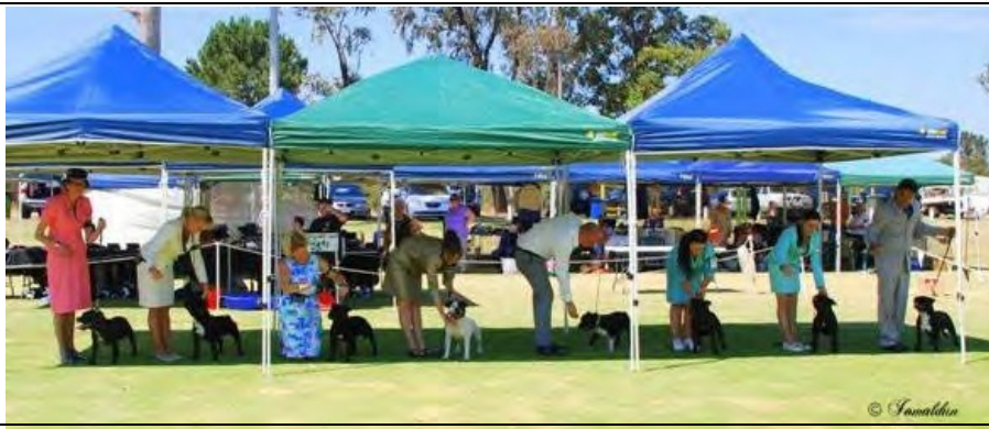
DOG CHALLENGE LINE UP