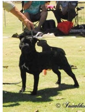
Ch Brohez Black Art