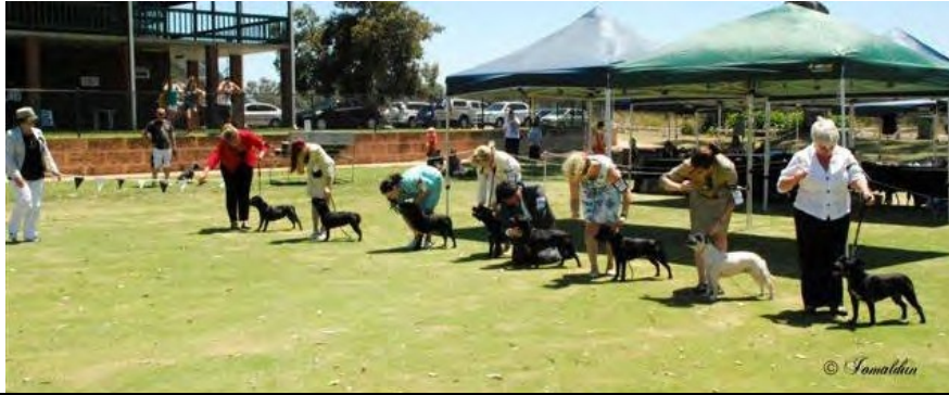
BITCH CHALLENGE LINE UP