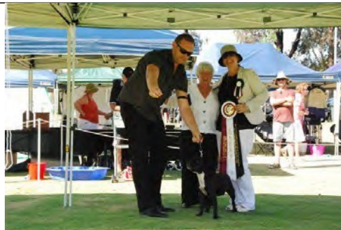
NEUTER IN SHOW Yarrapaws Western Gem