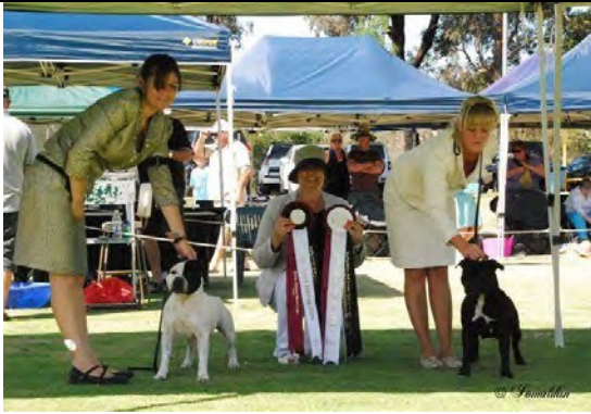
STATE BRED IN SHOW Ch Artisinal Why So Serious OPPOSITE STATE BRED IN SHOW Grd Ch Castlebar Strip Search (AI)