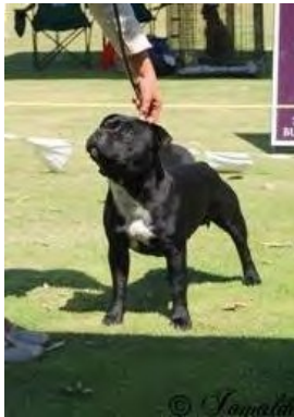
Ch Castlebar Rise N Shine (AI)