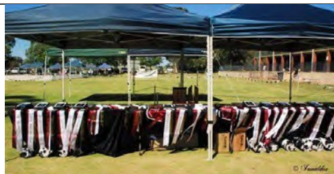
Sash and Trophy tables