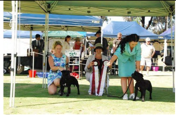
AUS BRED IN SHOW Ch Castlebar Believe It Or Not (AI) OPPOSITE AUS BRED IN SHOW Ch Brohez Black Soprano