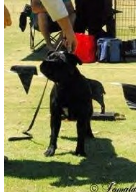
Ch Castlebar Believe It Or Not (AI)