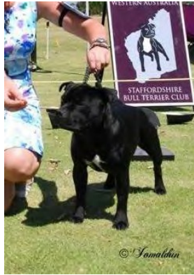
Ch Brohez Black Soprano