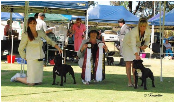
OPEN IN SHOW Ch Brohez Black Art OPPOSITE OPEN IN SHOW Ch Castlebar Rise N Shine