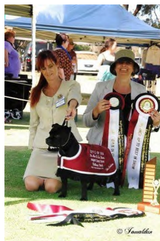
RUNNER UP BEST IN SHOW Ch Brohez Black Art F McBride