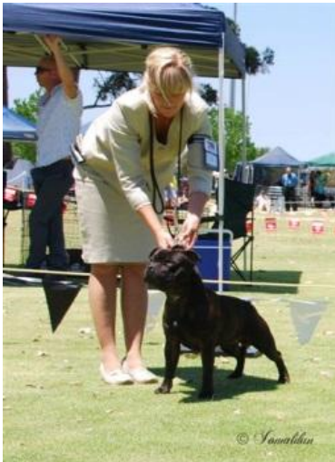
RESERVE DOG CHALLENGE Castlebar Full Metal Jacket (AI) R Bawden