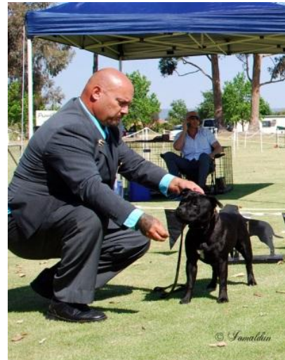
RESERVE BITCH CHALLENGE Ch Castlebar Believe It Or Not (AI) R Bawden