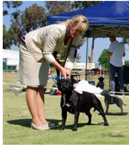
CHALLENGE BITCH Grd Ch Castlebar Strip Search (AI) R Bawden